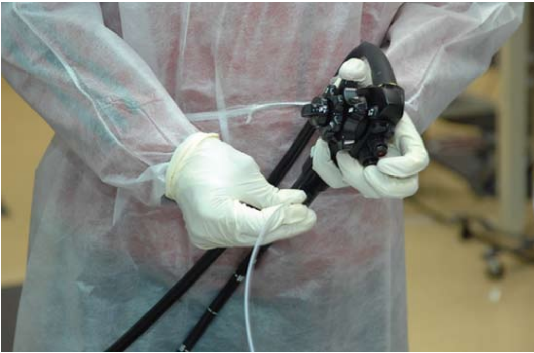
An endoscope is a medical device used by expert physicians to look inside the digestive tract.